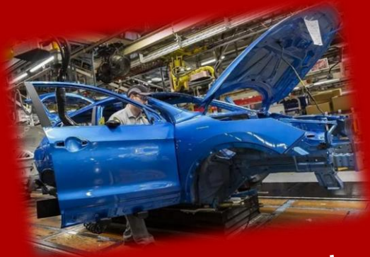
Nissan Sunderland Factory Tour

Day trips have pre-arranged pick-up points & times that can be viewed online or on our day trip flyer