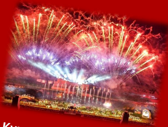
Kynren – An Epic Tale of England