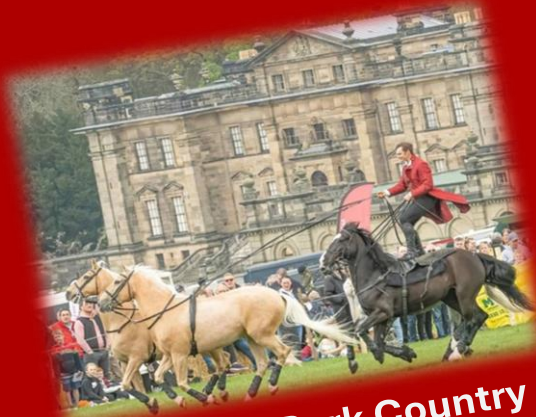
Duncombe Park Country Fair

We're busy finalising all of our day trips for 2025 but take a look at some of the trips we have on offer below. Dates and prices will be released soon so keep a look out for our flyers and on our website!