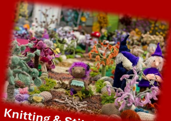
Knitting & Stitching Show